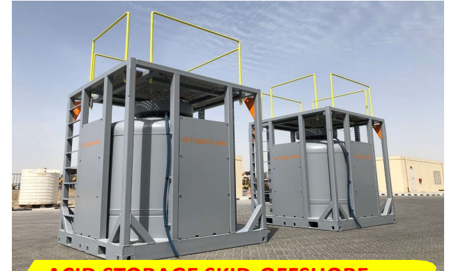
ACID STORAGE SKID-OFFSHORE