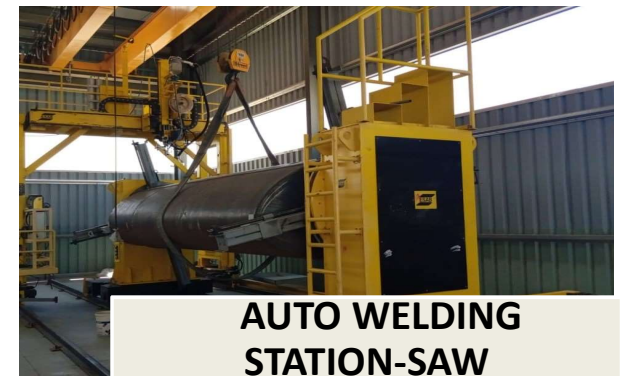
AUTO WELDING STATION-SAW