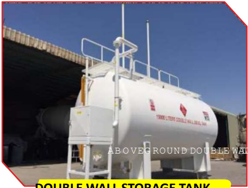
DOUBLE WALL STORAGE TANK