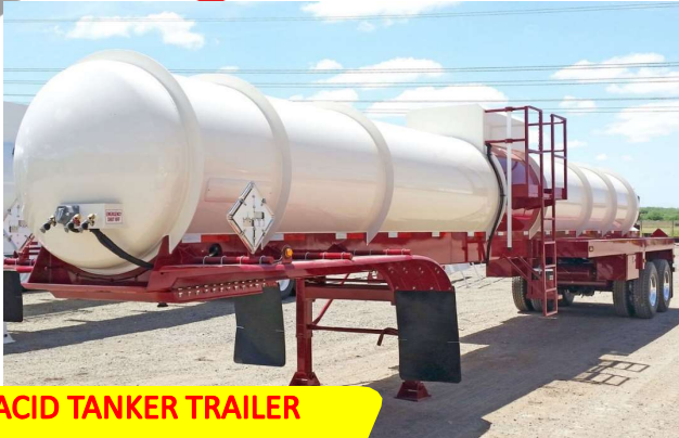
ACID TANKER TRAILER