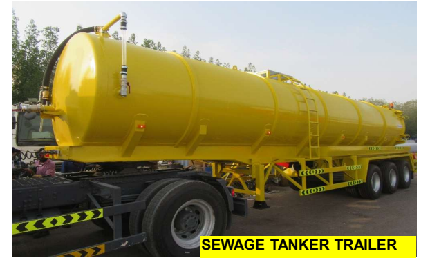
SEWAGE TANKER TRAILER