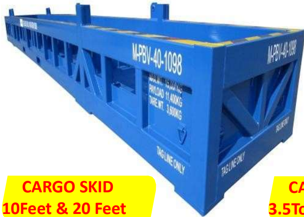
CARGO SKID 10Feet & 20 Feet