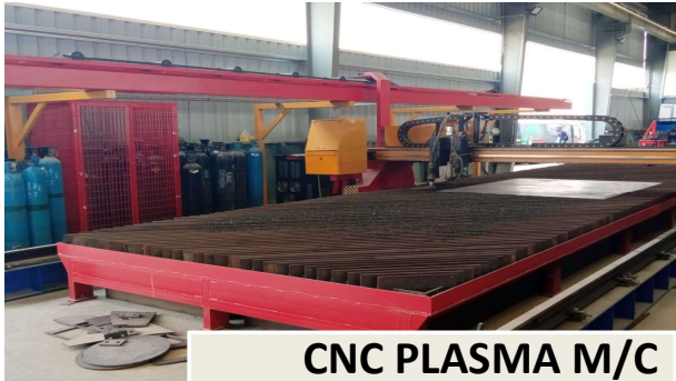
CNC PLASMA M/C