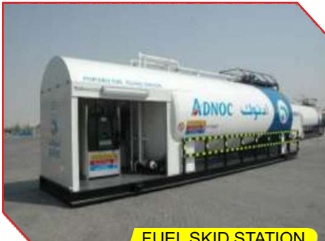
FUEL SKID STATION