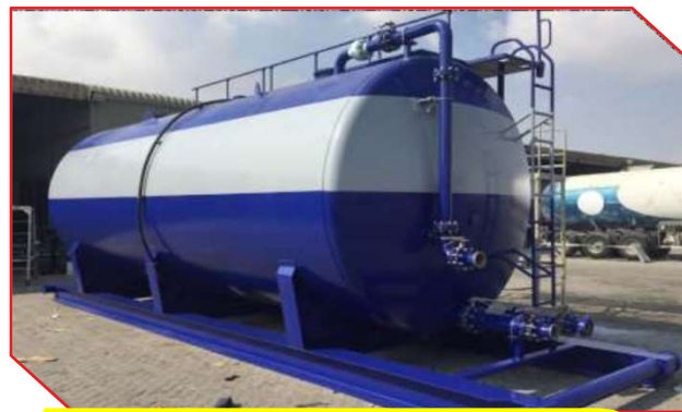
ACID STORAGE TANK-2000USG