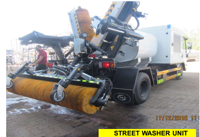
STREET WASHER UNIT