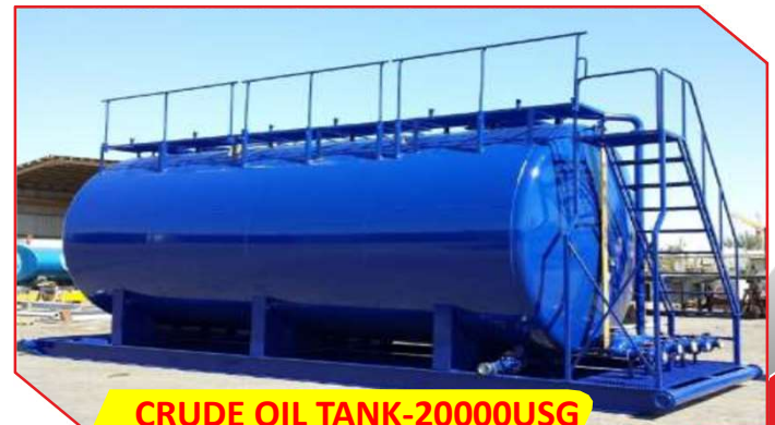
CRUDE OIL TANK-20000USG