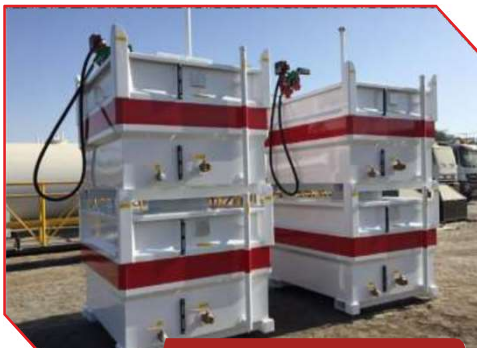
PORTABLE/STACKABLE FUEL STORAGE TANK