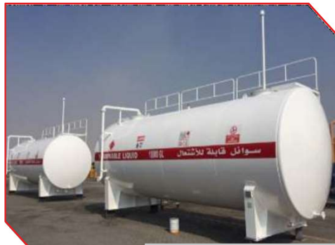
ABOVE GROUND STORAGE TANK