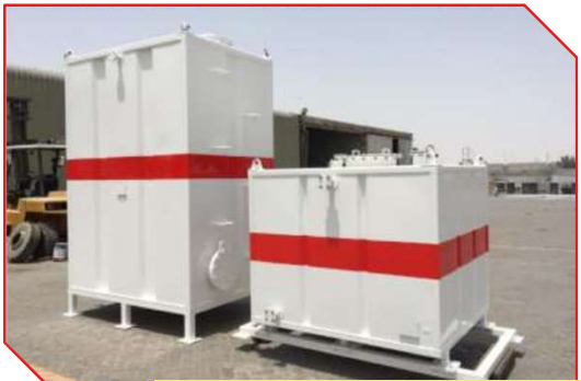
BULK STORAGE TANK