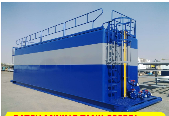
BATCH MIXING TANK-500BBL