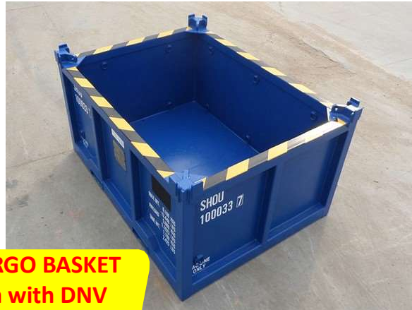
CARGO BASKET 3.5Ton with DNV