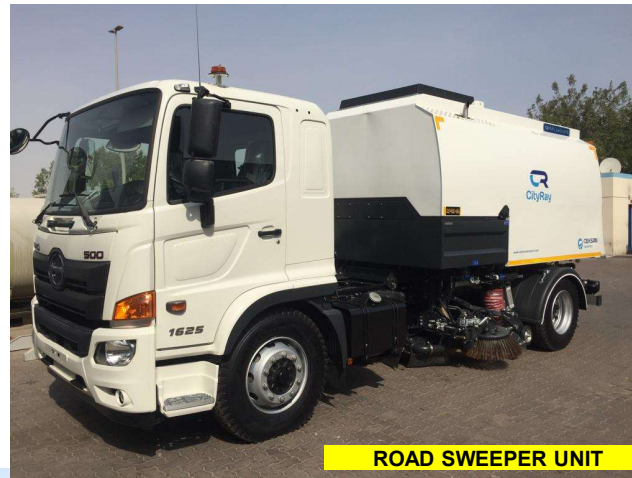
ROAD SWEEPER UNIT